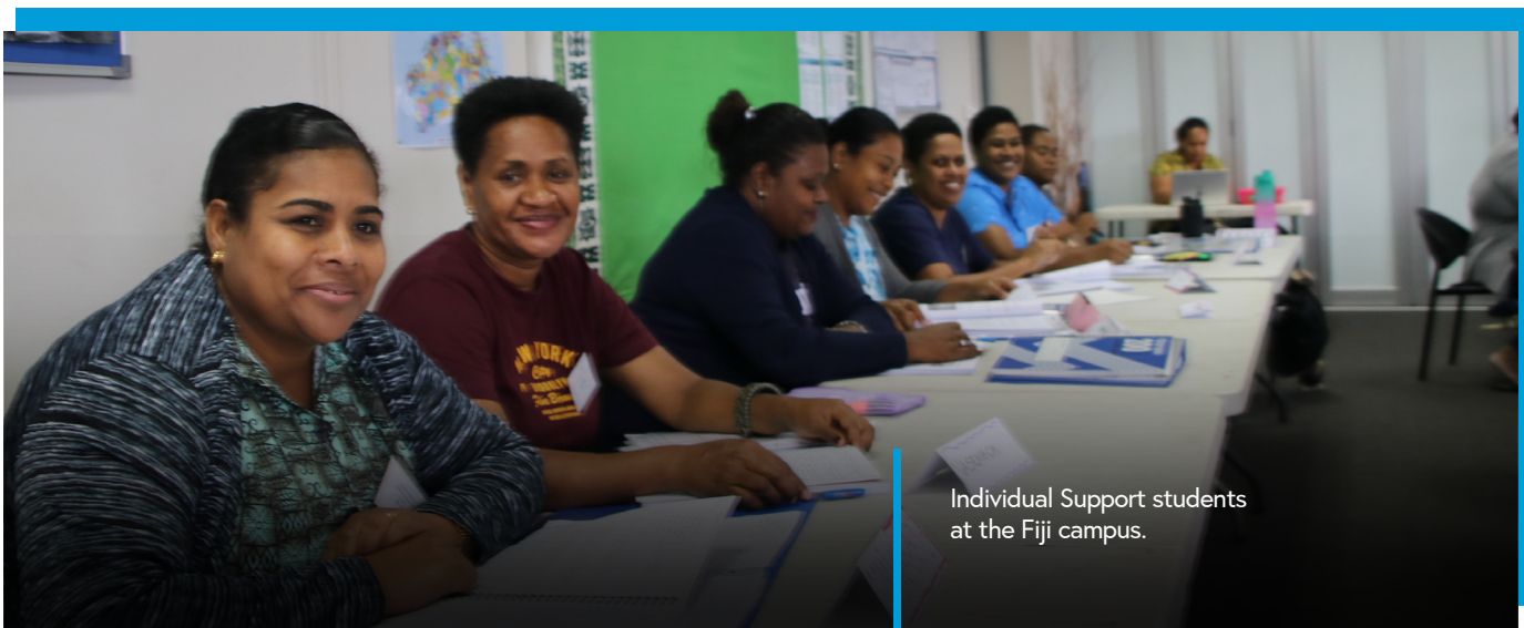
Individual Support students at the Fiji campus.