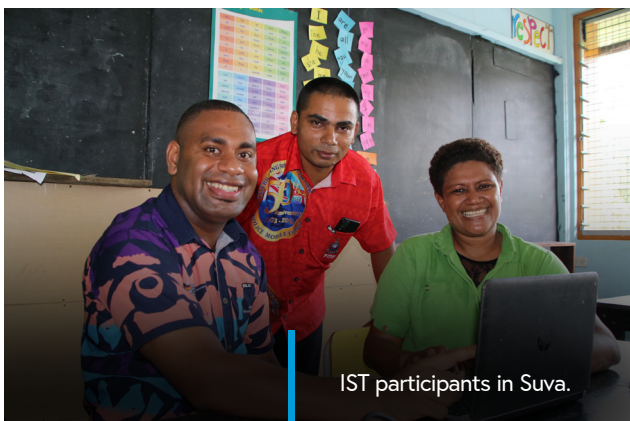
IST participants in Suva.