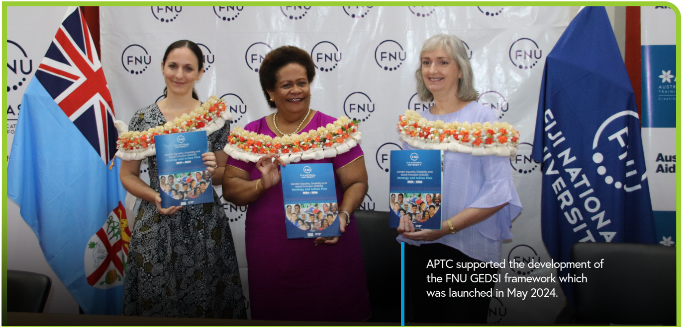
APTC supported the development of the FNU GEDSI framework which was launched in May 2024.