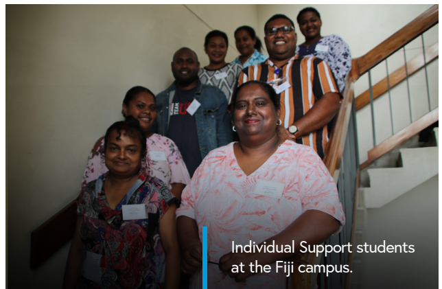
Individual Support students at the Fiji campus.