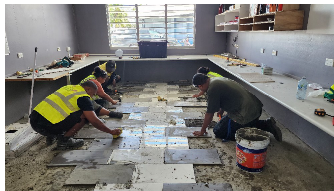
APTC is proud to support quality TVET in Nauru through the first-ever formal Wall & Floor Tiling course.