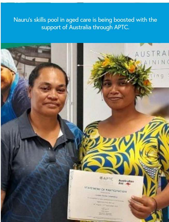
Nauru's skills pool in aged care is being boosted with the support of Australia through APTC.