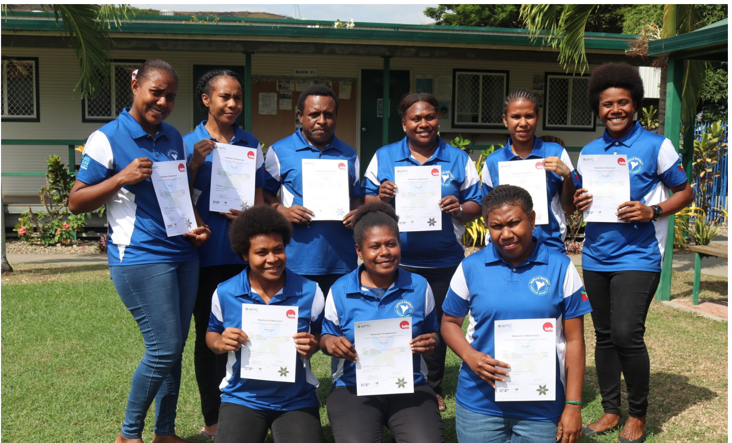
Proud participants from East New Britain with their certificates after completing the aged care training delivered by the APTC in Papua New Guinea.