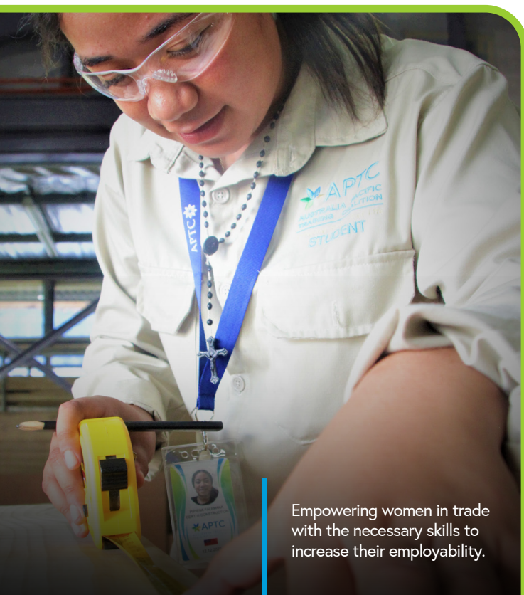
Empowering women in trade with the necessary skills to increase their employability.

APTC remains committed to supporting training needs as identified by the Tongan Government.