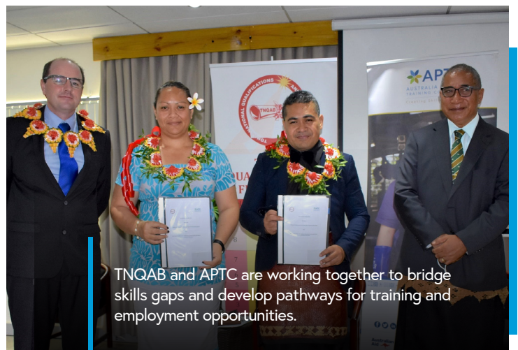
TNQAB and APTC are working together to bridge skills gaps and develop pathways for training and employment opportunities.