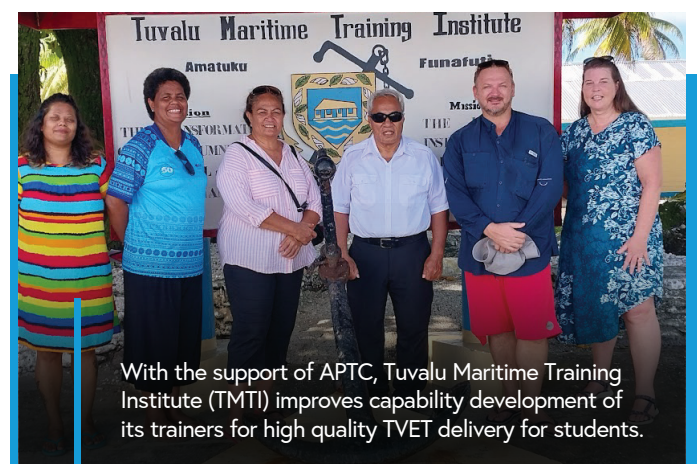
With the support of APTC, Tuvalu Maritime Training Institute (TMTI) improves capability development of its trainers for high quality TVET delivery for students.