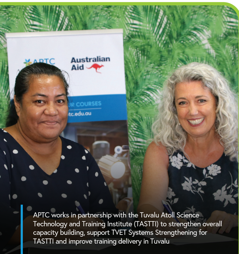
APTC works in partnership with the Tuvalu Atoll Science Technology and Training Institute (TASTTI) to strengthen overall capacity building, support TVET Systems Strengthening for TASTTI and improve training delivery in Tuvalu

The coordinator is based at the Department of Labour and works collaboratively with the Tuvalu Labour Sending Unit, relevant ministries, and stakeholders in the coordination of APTC's TVET system strengthening commitments. APTC's activities are aligned with the Government of Tuvalu's development priorities and the Tuvalu Technical & Vocational Skills Development (TVSD) Framework. APTC undertook a scoping and country planning exercise in 2023 to strengthen its engagement and remains committed to supporting the training needs identified by the Government of Tuvalu.