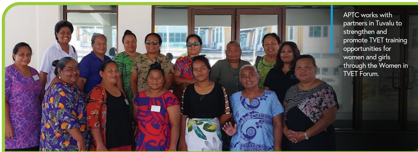
APTC works with partners in Tuvalu to strengthen and promote TVET training opportunities for women and girls through the Women in TVET Forum.