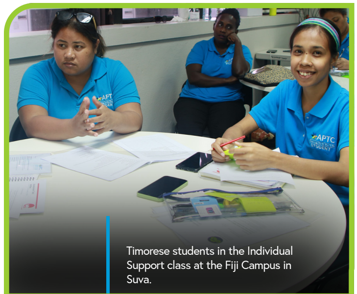
Timorese students in the Individual Support class at the Fiji Campus in Suva.

APTC engages and collaborates with government agencies, training providers, employers, and industry bodies to ensure alignment with Timor-Leste's National Labour Mobility Strategy.